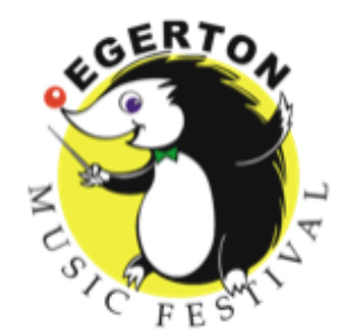
Registered Charity 1104628

Thanks are also due to the Millennium Hall Committee, the Church warden of St James' Church, the owners of Egerton House, The George and The Rose & Crown inns for providing venues for Festival events.